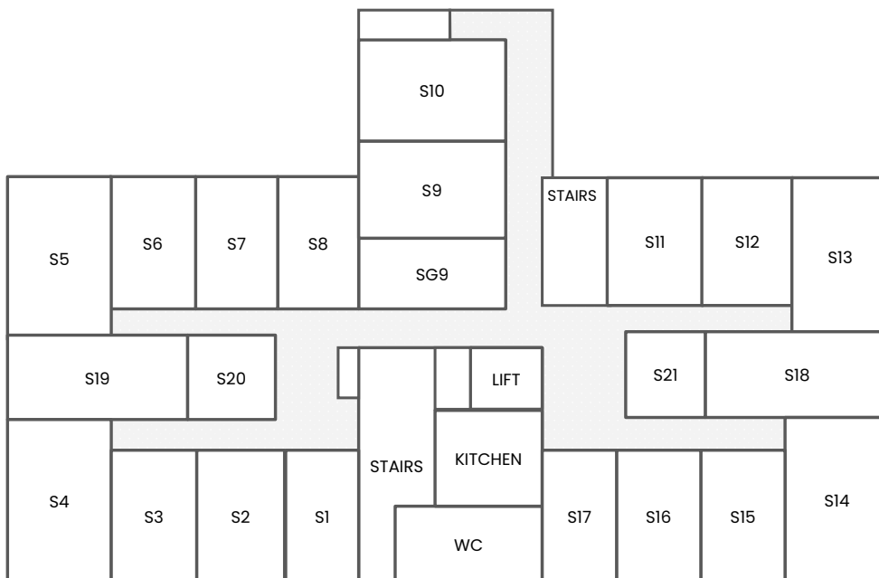
22-25 PORTMAN CLOSE—SECOND FLOOR